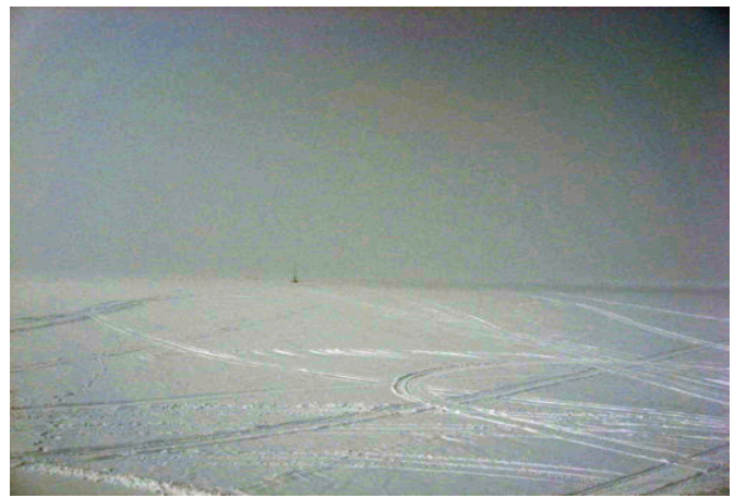
HHT2 technology allows for image "noise" to be removed for a clearer picture.